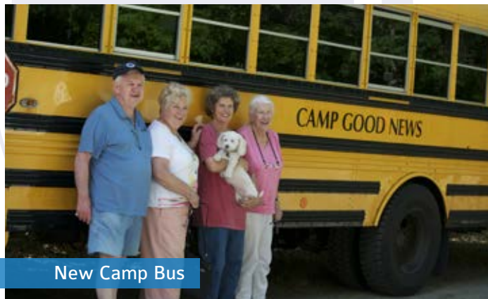
New Camp Bus