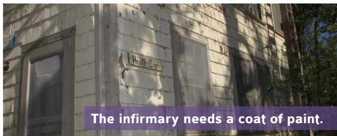
The infirmary needs a coat of paint.